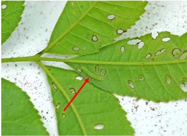
Figure 5 Pecan sawfly Periclista marginicollis