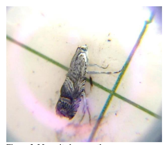
Figure 3. Mesquite bean moth