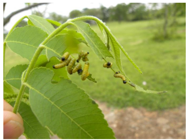
Figure 4. Pecan sawfly Megaxyela major

There are two species of sawfly that are common on pecan. Sawfly are actually larvae of a wasp and not a true caterpillar. There is only one generation per year and treatment is rarely needed, however, populations can get out of hand and a treatment with a broad spectrum insecticide will be needed.