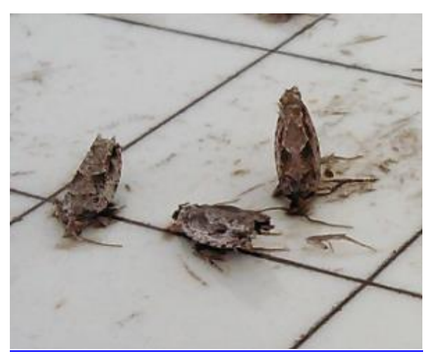
Figure 2. Pecan bud moth